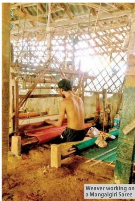
Weaver working on a Mangalgiri Saree

Mangalgiri is 18 kilometres from Vijayawada on the way to Guntur. A little over 250kms from Hyderabad, you can get here in under four hours. Take the National Highway 9 to drive down straight from Hyderabad.