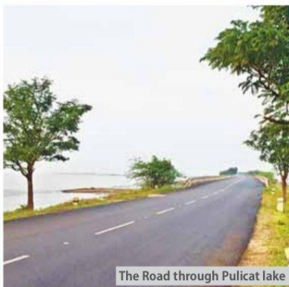
The Road through Pulicat lake