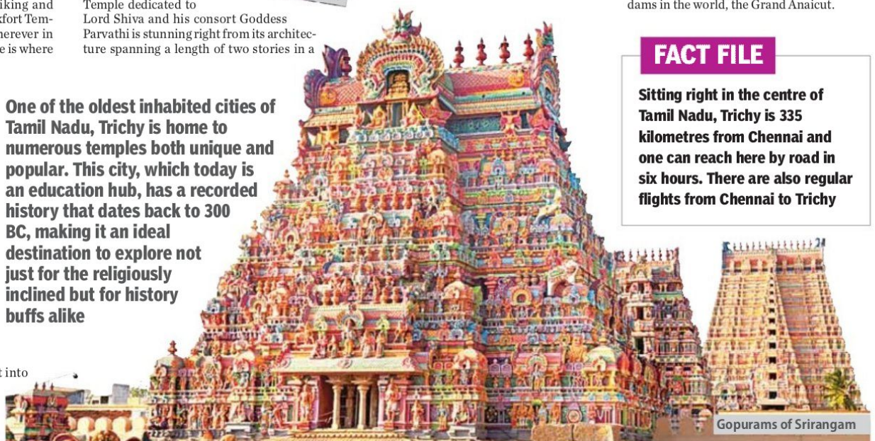
Gopurams of Srirangam

Sitting right in the centre of Tamil Nadu, Trichy is 335 kilometres from Chennai and one can reach here by road in six hours. There are also regular flights from Chennai to Trichy